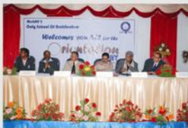
Orientation Day function