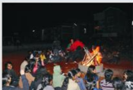
Gala Evening entertainment during the function