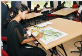
Aptitude Search for Architecture 2011 Competition