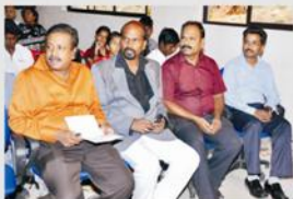
During the function