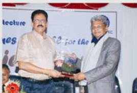
Orientation Day function